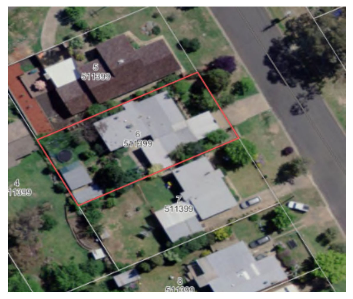
Figure 1: Aerial of Subject Site (Lot 6, DP 511399, known as 51 Dalhunty Street, Tumut NSW 2720)

The site is currently utilised for residential use.