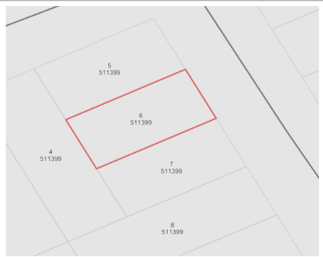
Figure 2: Cadastral map of subject site and surrounding properties